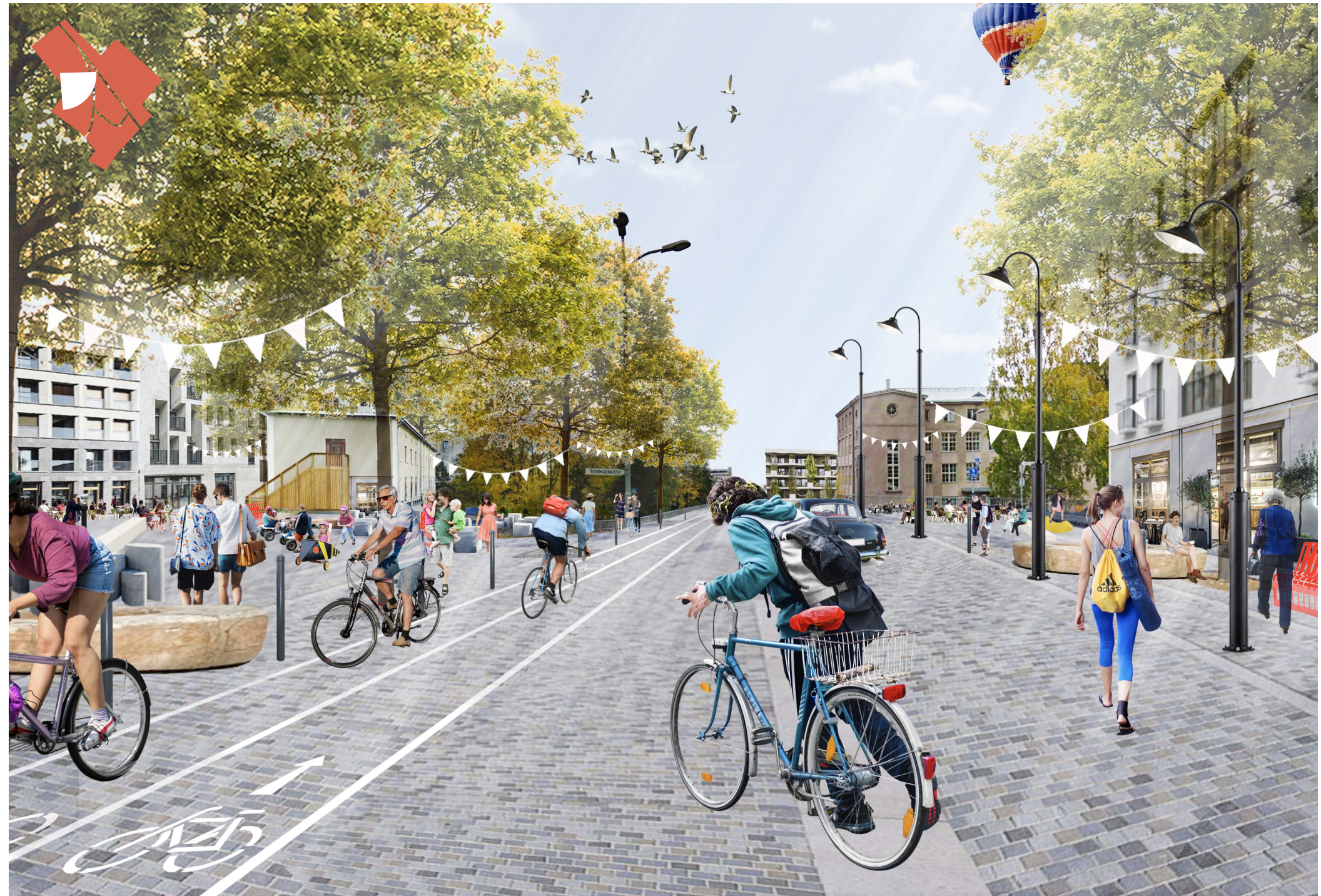
The streets around the train station are designed for shared mobility and the public space is pedestrian and cycling-friendly