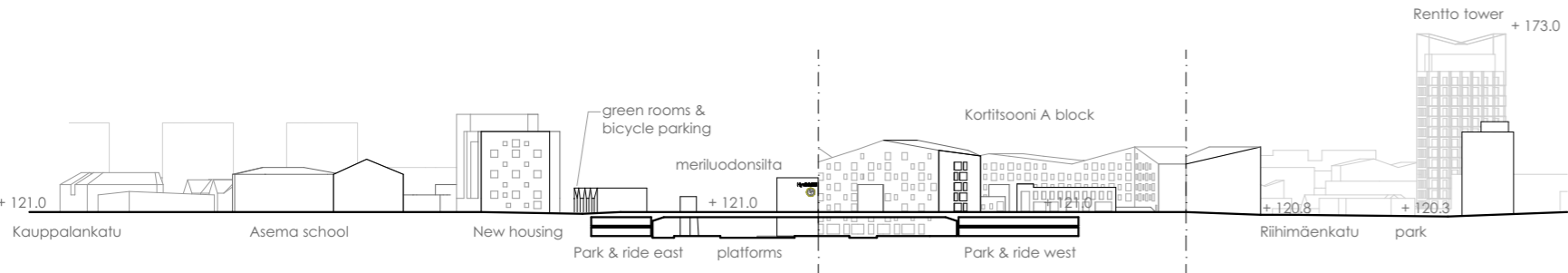
Section B-B 1:2000