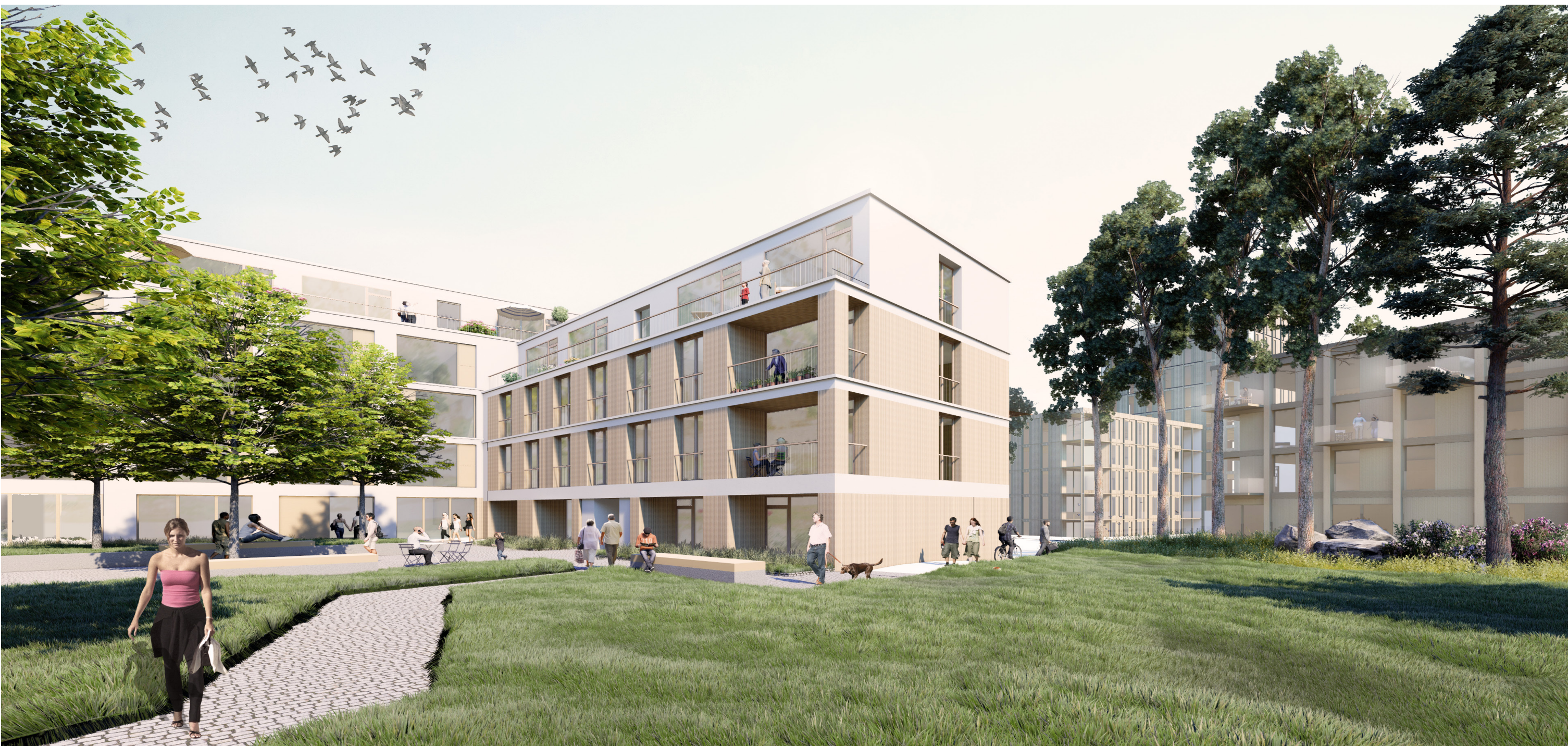
View from the typical housing block towards the north.