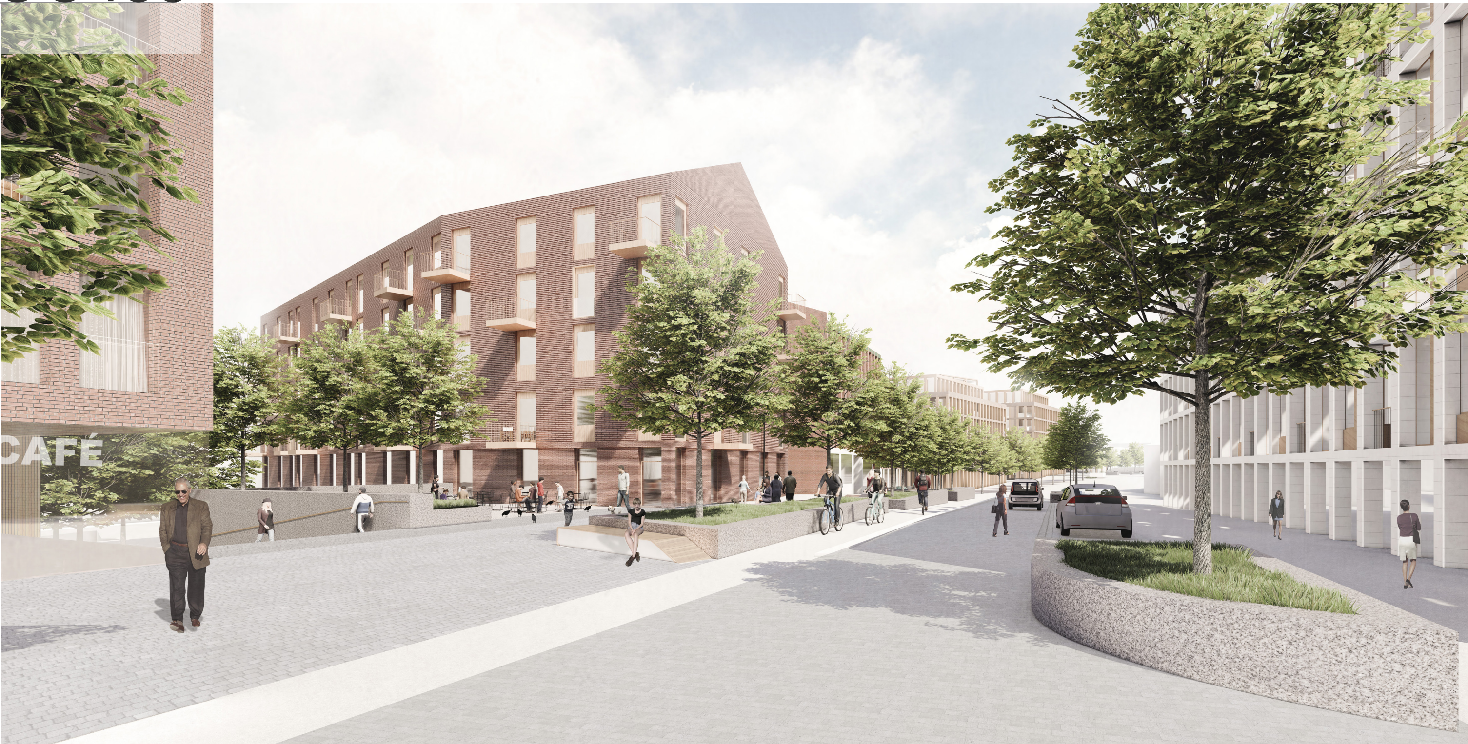
View from Uudenmaankatu street towards the station.